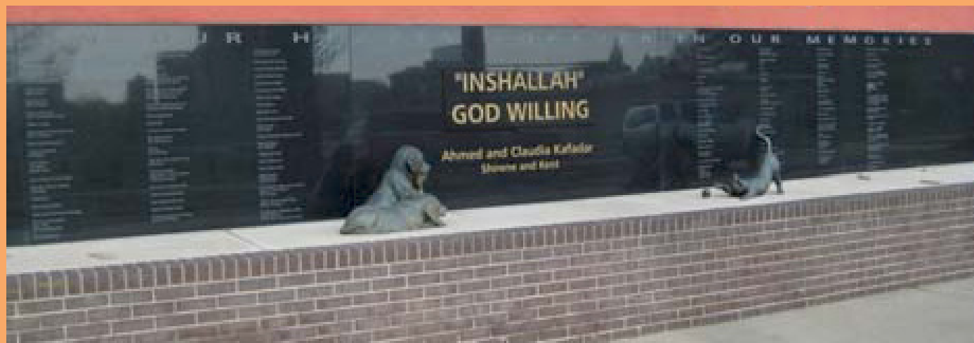
Paws Fur Love Memorial Wall at MaxFund