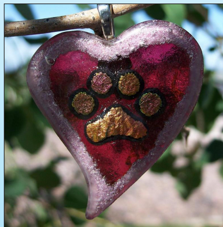
Glass Weeping Heart Pendant by Pet Memorial Glass Jewelry

As we mentioned last time, people are rarely able to make rational decisions when they have just lost a pet. By deciding now on whether you want to bury or cremate your pet, you will know what you want for your pet when the time comes.